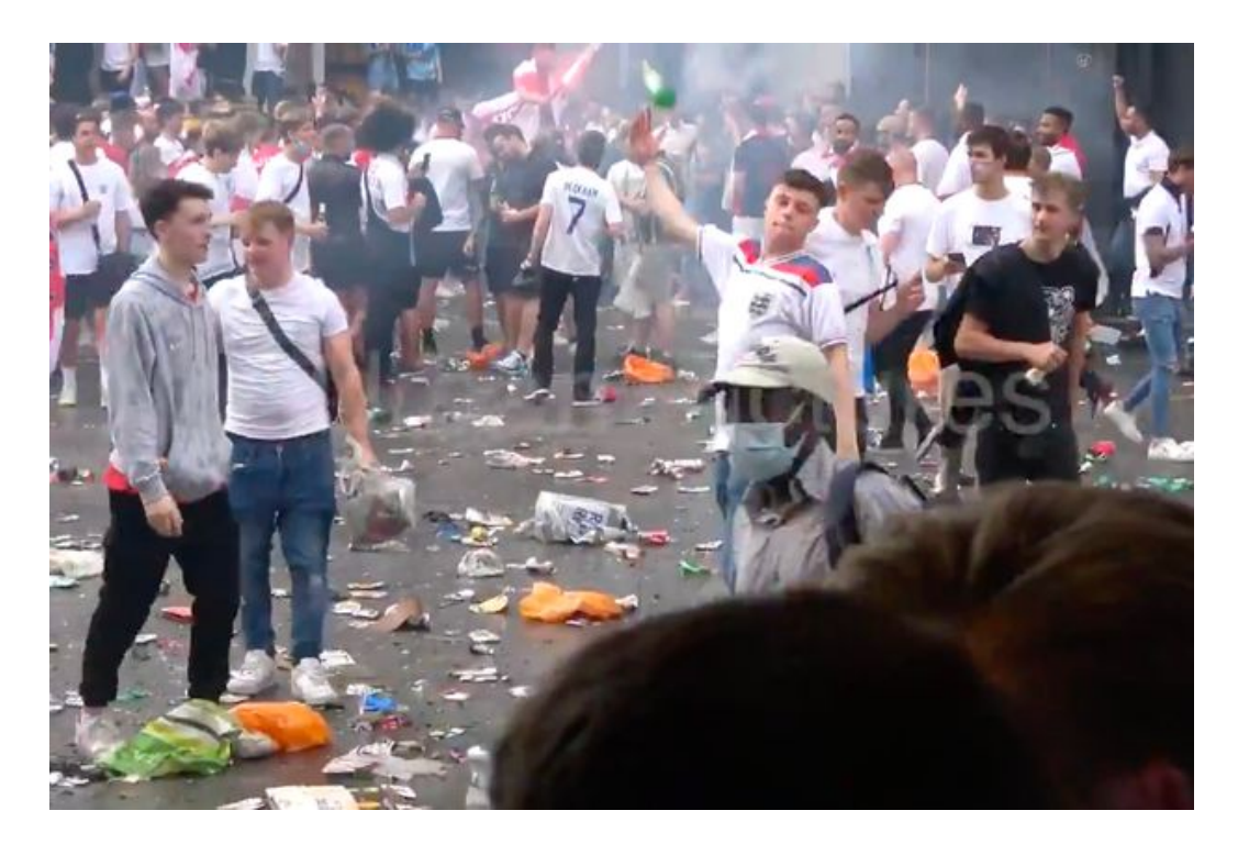
Ugly scenes at Leicester Square.

And unlike the fans on Wembley Way, Southgate urged his players to stay calm ahead of the fixture.