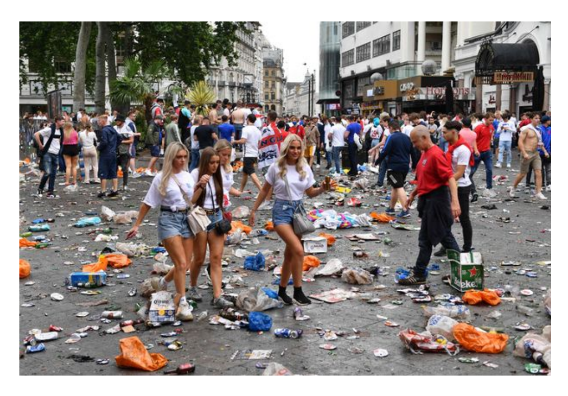
People walk through the garbage left by fans in Leicester Square

Litter was strewn all across the square in what marked disgraceful scenes ahead of kick off.