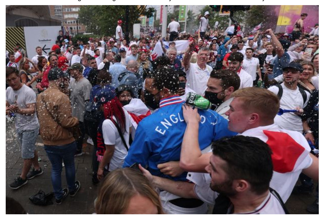
Rio Ferdinand is clattered with a beer on Wembley Way.

"Safety measures were quickly activated in the relevant areas and there were no security breaches of people without tickets getting inside the stadium."